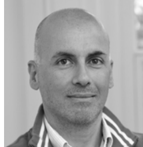
Gaetano Casale Water Beyond Europe IHE Delft