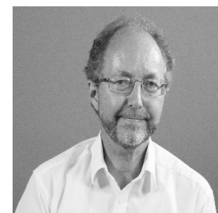
Jens Prismo CL8: Water-Smart Cities CALL Copenhagen