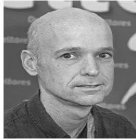
Leonard Osté Contaminants of Emerging Concern Deltares