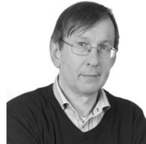
Floor Brouwer Water-Energy Food Biodiversity Nexus WUR